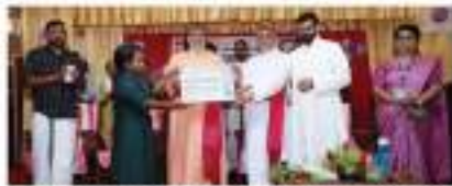
SPRINGSHEDED BASED WATERSHED DEVELOPMENT PROGRAMME

On March 27th, 2023 Shreyas held a launching ceremony for five new projects in various sectors.