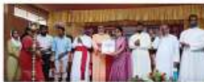
COVID REHABILITATION PROJECT Small business initiative supporting program by Save A Family Plan