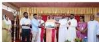
SAJEEVAM Anti-drug campaign supported by Caritas India and KSSF