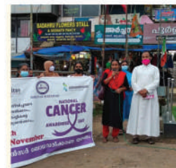
The campaign directly reached almost 300 people and it will benefit 1500 families indirectly. The program was able to create awareness among the people and made them think about the causes and consequences of cancer and the possible treatments for the disease. It also helped to remove the stigma and fear attached to cancer and gave an insight into the government schemes available for cancer patients. It reminded the people about the need for care and support of society to the affected family. The program guided them to recognize the early signs and symptoms of cancer, thus enabling them to seek treatment at an early stage. Improved health conditions will improve the quality of life of the people in these regions which will enhance their well-being. "It is a dream to conduct such innovative actions at different parts of the country to spread the Cancer awareness among people," says Sibi Prakash, the Program Associate, Caritas India. Cancer is a menace that eats away at humans. Despite the growing number of new cancer patients, many are still unaware of this danger. A majority of people are ignorant about the precautionary and preventive aspects of cancer. Hence the awareness was apt and able to reach out to more people. It is high time for an extensive awareness campaign to mitigate the loss created by cancer.